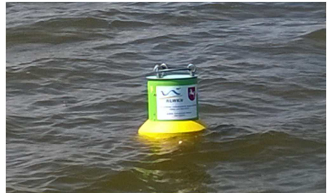
Fig 4: Released measuring buoy in the Dümmer See. The lake is a maximum of 1.5 m deep and the Hunte flows through it.

In 2018 the NLWKN will deploy a third measuring buoy on Lake Zwischenahner, giving the NLWKN a good overview of the three largest lakes in Lower Saxony and