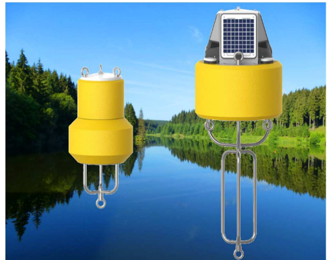
Fig 2: 'Measuring buoy 50' (left) and 'Measuring buoy 150' including three solar panels (right) Modification on customer request are possible

Chlorophyll a and blue-green algae data is important, particularly in regard to the use of the lakes for swimming, allowing the authorities to detect concentrations of blue-green algae or cyanobacteria, both dangerous to humans and fauna, at an early stage. As public safety is a major concern, the NLWKN closely observes phytoplankton development, which also includes blue-green algae, in its investigations.