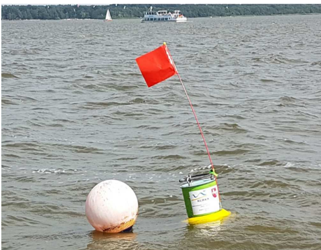
Fig. 1: Measuring buoy on Lake Steinhuder Meer. The red flag makes the measuring buoy visible to sailors even when the waves are high.

In order to measure the chemistry and water quality of the two shallow lakes, the Sulingen office of the Lower Saxony State Office for Water Management, Coastal and Nature Conservation (NLWKN) uses measuring buoys with YSI EXO multi-parameter probes. The buoys sit in the middle of the lake, where representative data is collected and transmitted via a data logger, providing the NLWKN an overview of the current water quality in the two lakes. The measuring buoys monitor pH, conductivity, temperature, oxygen, chlorophyll a and blue-green algae.